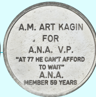
Lot 3: 1997 Art Kagin, ANA VP Token, Unc.