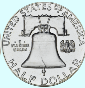
Lot 1: 1963 Franklin Half Dollar, Proof