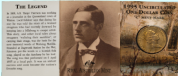
Lot 2: 1995 1 Dollar, Banjo Paterson, KM-269, Australia